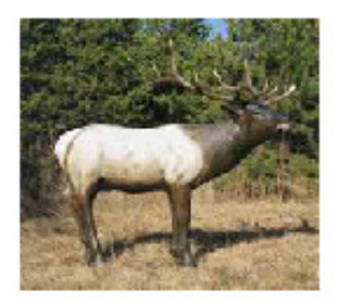
2013 Nebraska State NFAA Marked 3-D Tournament

Sunday, August 11<sup>th</sup> Norfolk Archery Club Norfolk, Ne